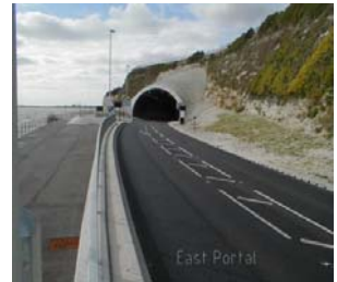
Ramsgate Harbour approach road used FABM

The UKQAA is always striving to update and improve its portfolio of publications and to keep up to date the web site. For example a New Environmental page and BRE Environmental Profile Certificates are available have recently been put on the web site. This gives an overview of the benefits of using PFA and FBA in construction. Additionally, the UKQAA asked BRE to produce updated Environmental Profiles for both Pulverised Fuel Ash and Furnace Bottom Ash. These certificates are now available by clicking the appropriate link above. In addition a new datasheet has been published entitled Environment and Sustainability , which is available from the following link: Datasheet 8-1 .