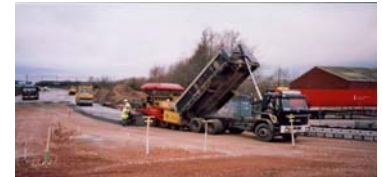
Figure 1 - Sustainable FABM road construction at Burntwood, Staffs

The UKQAA is formulating a Responsibly Sourced Materials scheme for the coal fired power stations operators. This has recently been reviewed by the Technical Committee and a revised draft due to be produced in the near future.